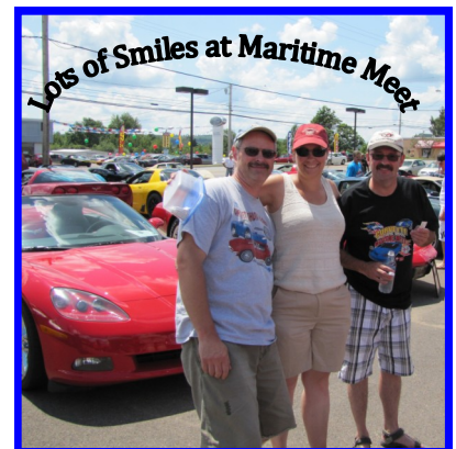
Lots of Smiles at Maritime Meet